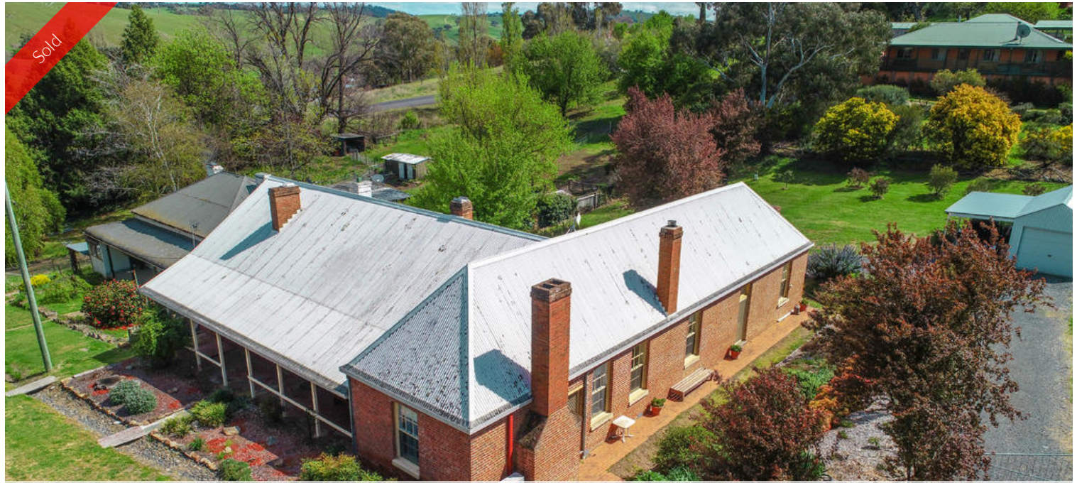
14 Collins St, Carcoar