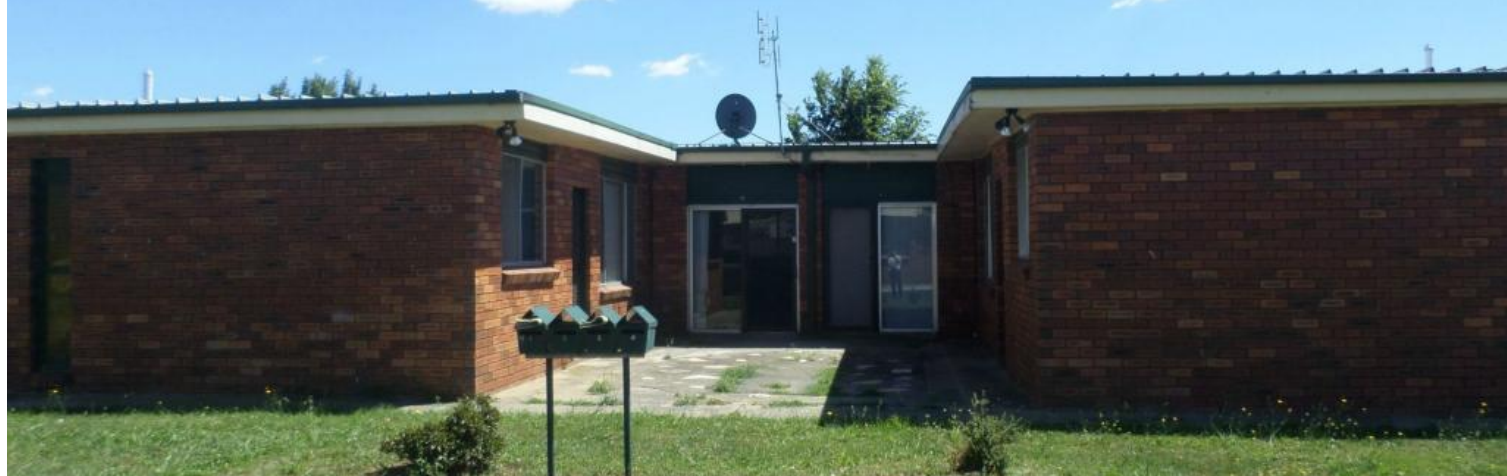
Unit 2, 11 Binstead St, Blayney